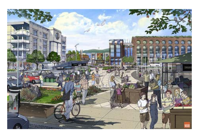
Figure 6: Artist Impression of the Sonoma Mountain Village town square