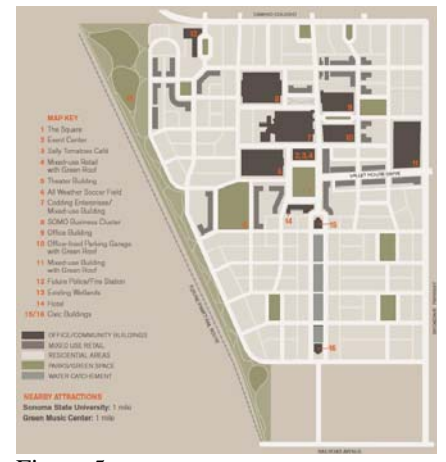
Figure 5: Sonoma Mountain Village site plan