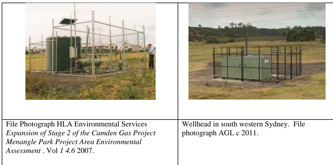
Figure 4 Wellhead site and infrastructure in Camden area

The gas retrieval process obviously incurs some risks, and wellhead sites may carry signs warning of the danger of “explosive vapours” and prohibiting “unauthorised entry”. Accordingly, it is likely the property market would take a negative view of the presence of wellhead sites and this is evidenced in the Queensland gas case of Sullivan v Oil Company of Australia and Santos (in Scarr 2004).