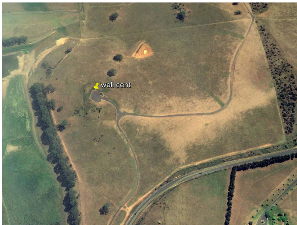
Figure 3 Wellhead and access roads at Menangle c 2007 (road curves east to northeast to serve additional well)

34° 7.413' S 150° 43.0662'E.