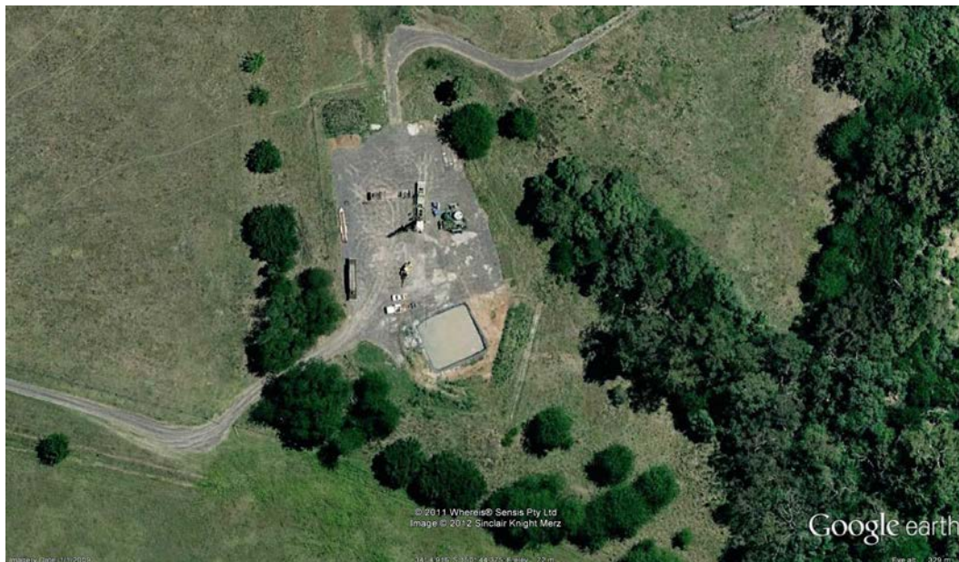
Figure 2 Well undergoing maintenance south western Sydney NSW circa 2007

34 o 4.890' S 150 o 44.361'E