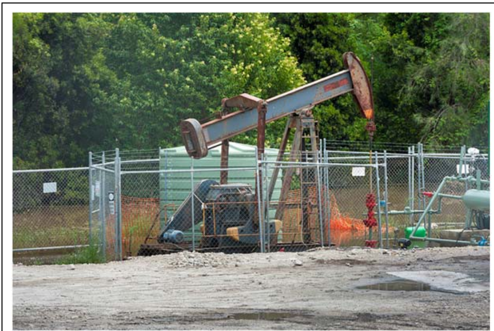
Figure 1 CSG Well at Menangle showing wellhead within fenced area

Injurious affection arises from the use and the activities upon the land taken (see Hyam 2009, 445, Brown 2009, 165, 166), and it is potentially a more significant item of harm than severance. In CSG extraction, the harms resulting from the use and activities include drilling, fracking, the extraction process, well maintenance, vehicles using roads and maintenance operations are classified as injurious affection ( Sullivan and Sullivan v Oil Company of Australia Limited and Santos Petroleum Operations Pty Ltd, [2003] QLRT 2, 23 ).