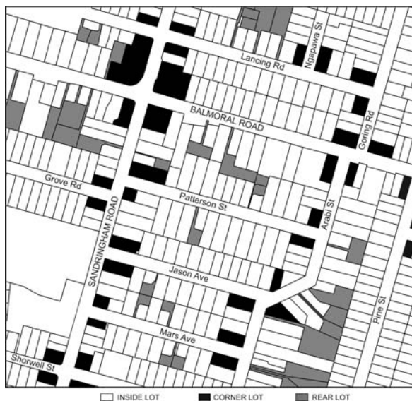
Figure 2: Excerpt Auckland city parcel map illustrating lot position types