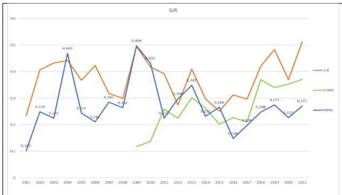
Figure 1a. SJRs of PRPRJ, JPIF and IJHMA, 2001 - 2021.